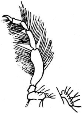
FIG. 37.—Second gnathopod of Stereomastis suhmi .

The first pair of gnathopoda is short and pediform, and consist of only six joints; the coxa and basis appear to be closely impacted, but not fused together; the ischium and meros are broad and flattened, the external margin forming a continuous arch, the internal exhibiting signs of an articulation between the two joints; the carpos is pear-shaped, and articulates at its smaller extremity with the external angle of the meros; it is furnished with strong, stiff hairs, all of which are fringed with short, stiff, sub-conical spines; the propodos appears to be fused with the dactylos, between which and it there is no definite articulation, but at the position where it normally exists, there are two large, strong, slightly curved spines on the outer surface, and one similar on the inner; the meros and ischium are similarly armed, but mostly on the inner margin.